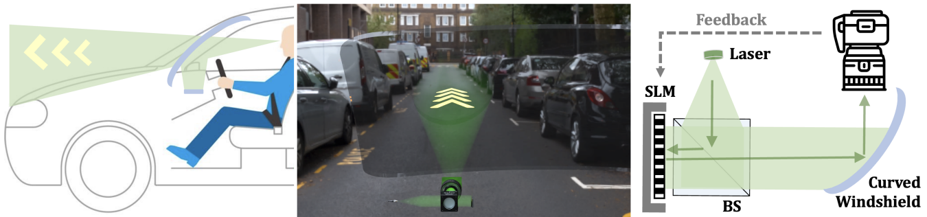
Figure 1: Conceptual illustration of a holographic HUD that applies to windshield AR navigation scenarios and supports multi-plane display experience, leveraging an off-the-shelf free-form geometry optical combiner, which can be compensated by a learning-empowered, calibrated hologram generation algorithm to deliver virtual 3D scenes without distortion.