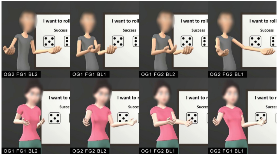
Fig. 1. Frames extracted from each of the 8 stimuli clips used in the first study